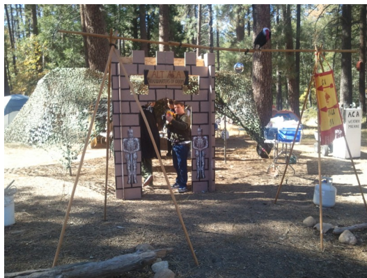
Alt Aca's "Dome of DOOM".